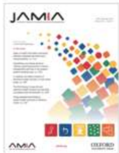
Volume 25, Issue 9